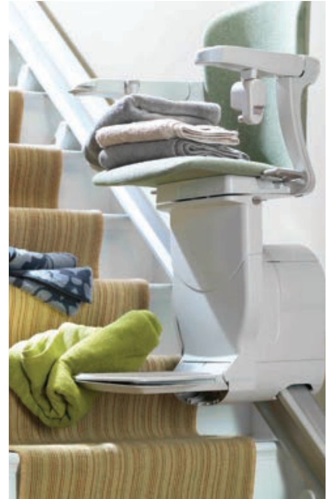
Sensors detect any obstructions on your stairs

"We are delighted with the stairlift. My wife enjoys the ride. It gives her independence. She finds it very easy to use"