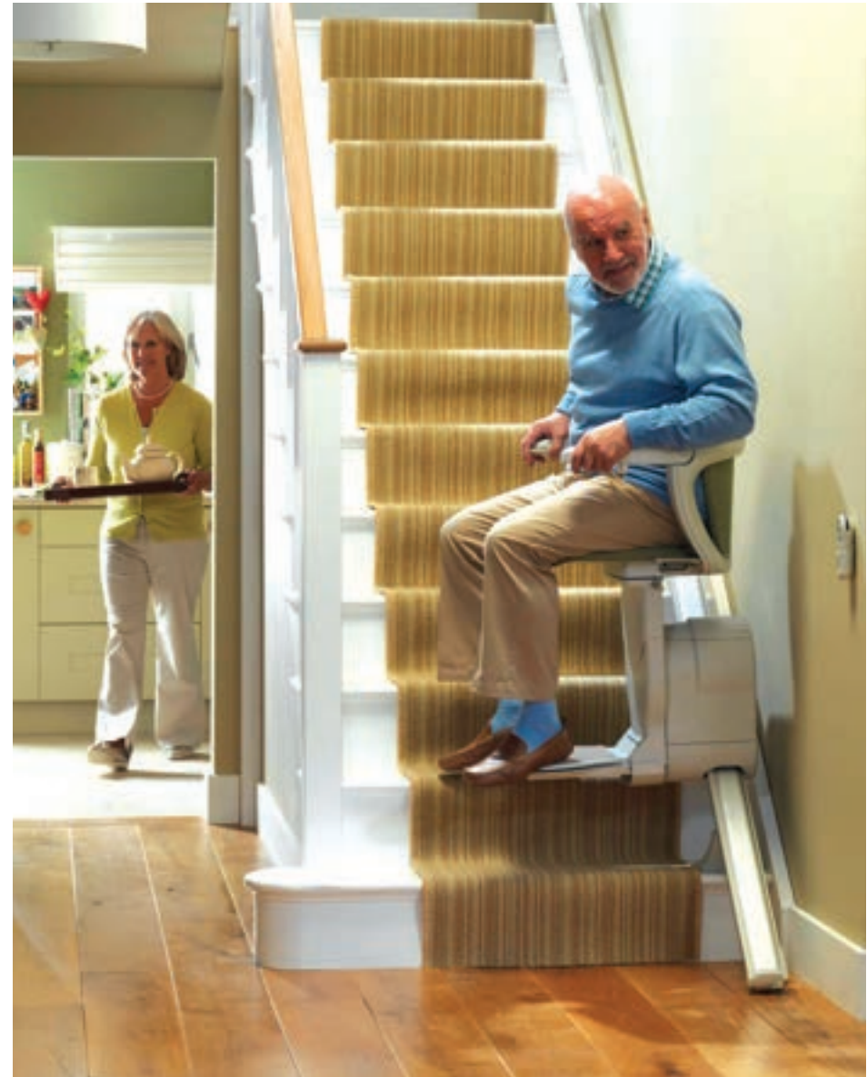
A gentle touch of the controls is all it takes to climb your stairs