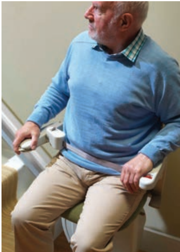
Immobiliser seatbelt (standard)