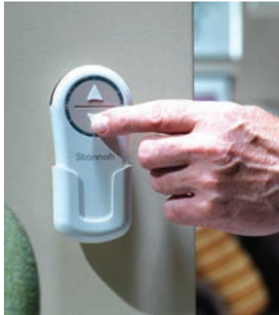
Use the wall control to call your Starla