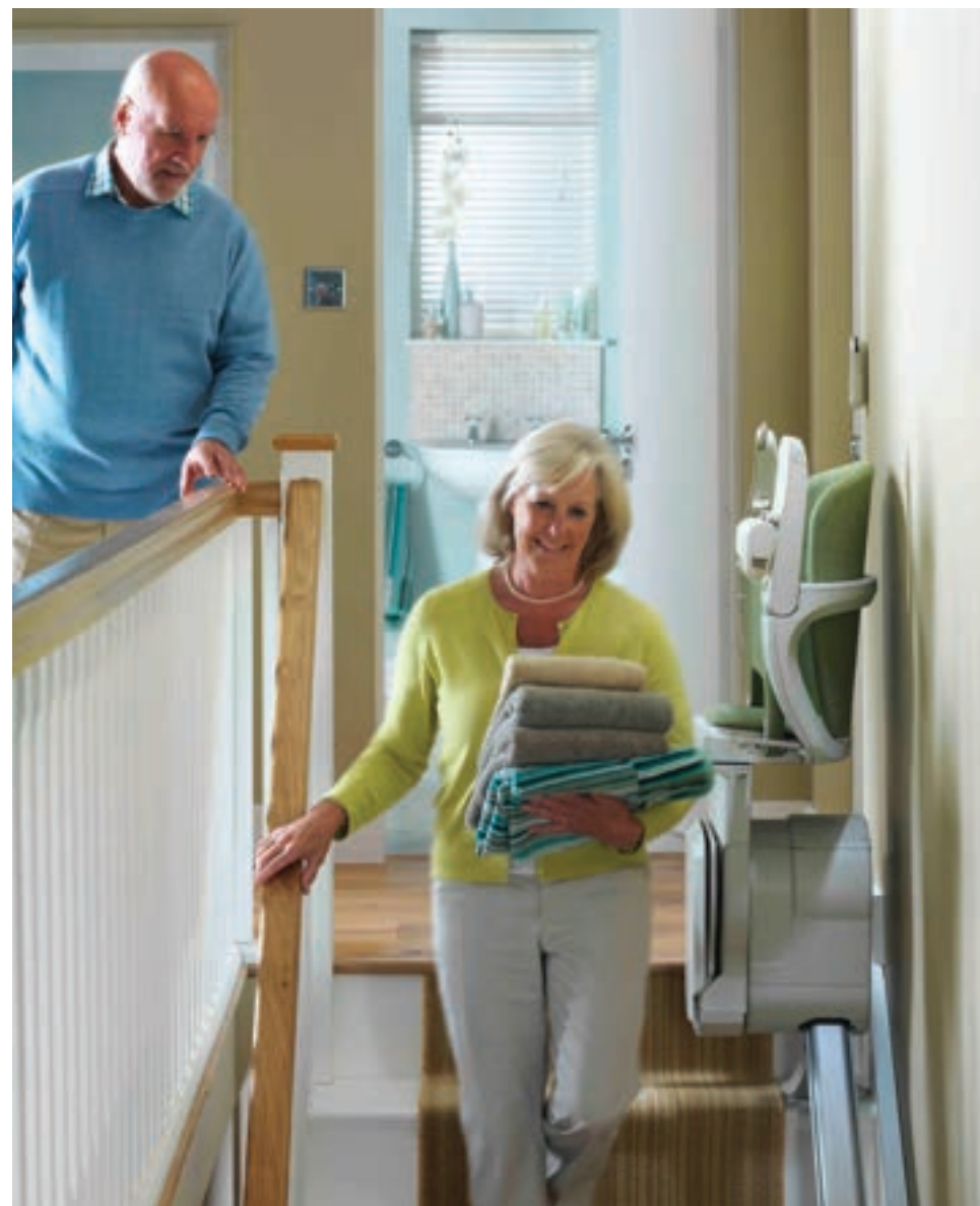
The Starla's slimline design allows others to still use the stairs

Tailor it to your tastes and home by choosing a fabric, with or without a light or dark wood finish or select the full vinyl upholstery in a range of sophisticated colours.