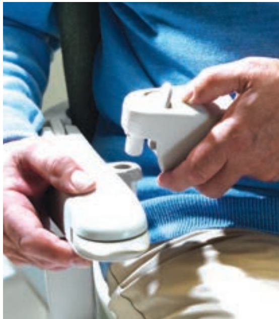
Seatbelt can be fastened with one hand

Effortless and simple. This sums up beautifully just how much thought and care we have designed into each and every function of our Starla stairlift. From the safe and easy-to-use seatbelts, to stairlifts that take up minimal space on your staircase, we have made your Starla stairlift simple, safe and reliable.