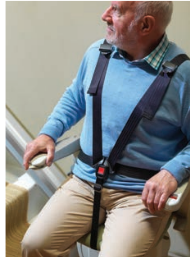
Five point harness